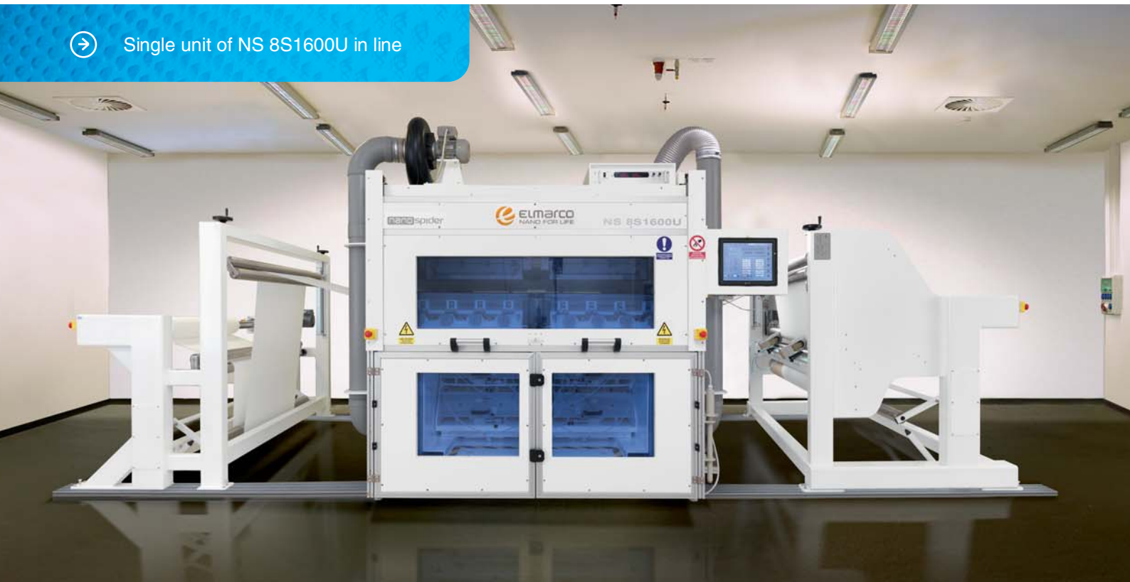
→ Single unit of NS 8S1600U in line

Elmarco's Nanospider™ NS 8S1600U is the base spinning unit for the industrial production of nanofibers in our scalable electrospinning line. Combining of up to four spinning units, NS Production Lines deliver high volume throughput for cost effective production. Optimized for non water soluble polymers , the NS 8S1600U is based on Elmarco's proprietary needle-free electrospinning process, to deliver the performance that your products and customers need.